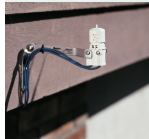
Works with Weather Sensors