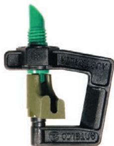
Inverted Rotor Spray™ 10-32 UNF Thread