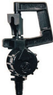
Vari-Rotor Spray™ 10-32 UNF Thread