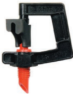
Rotor Spray™ 10-32 UNF Thread