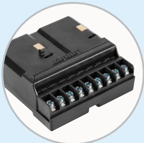
Station Expansion Modules