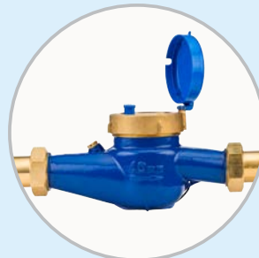
HC Flow Meter