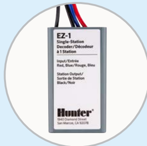
EZ Decoder System*