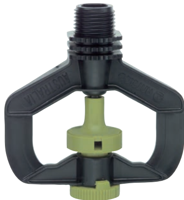
Inverted Rotor Max™